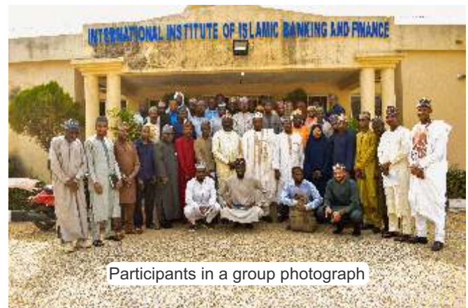
Participants in a group photograph